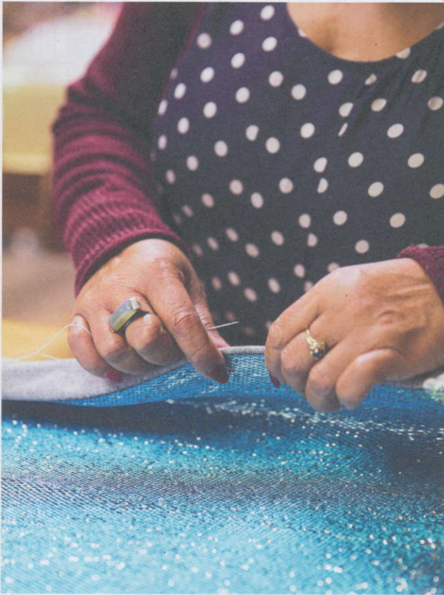
finishing by hand

Ronan and Erwan Bouroullec need little introduction, with numerous contemporary classics to their name and designs that feature in modern art museums from Paris to New York and London. In this recent work, they created a multilayered jacquard tapestry with patterns and colours that change with every angle. The aim was to capture a sense of brilliance and light, which was achieved through a dynamic interplay between shiny, reflective and matt materials. The piece formed part of the brothers' recent 'Seventeen Screens' installation at the Tel Aviv Museum of Art.