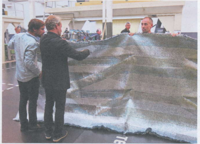
the designers checking the fabric